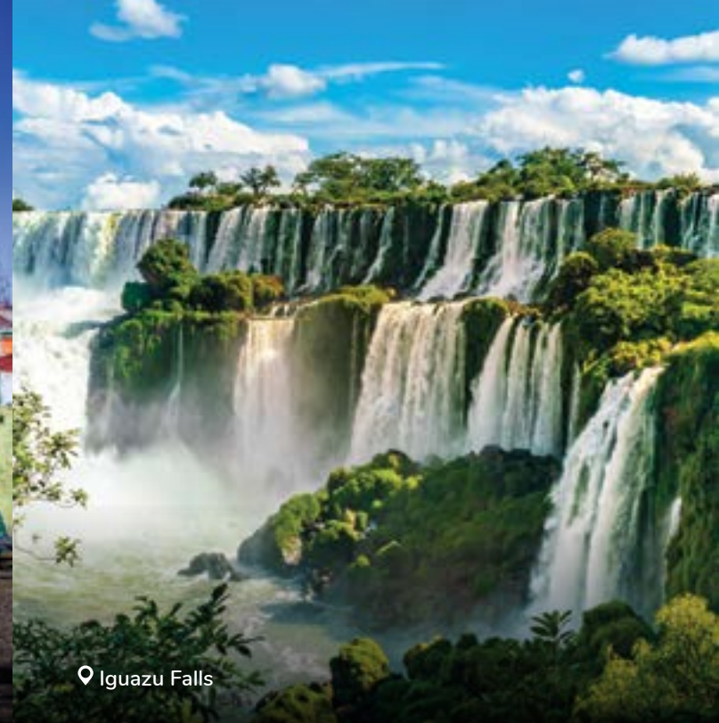
📍 Iguazu Falls