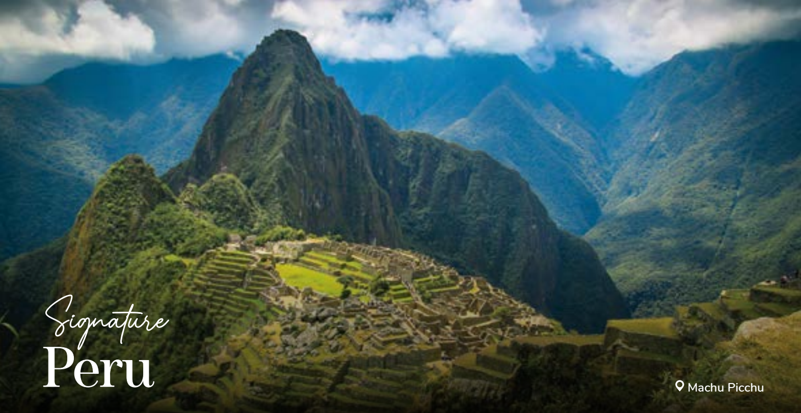
📍 Machu Picchu