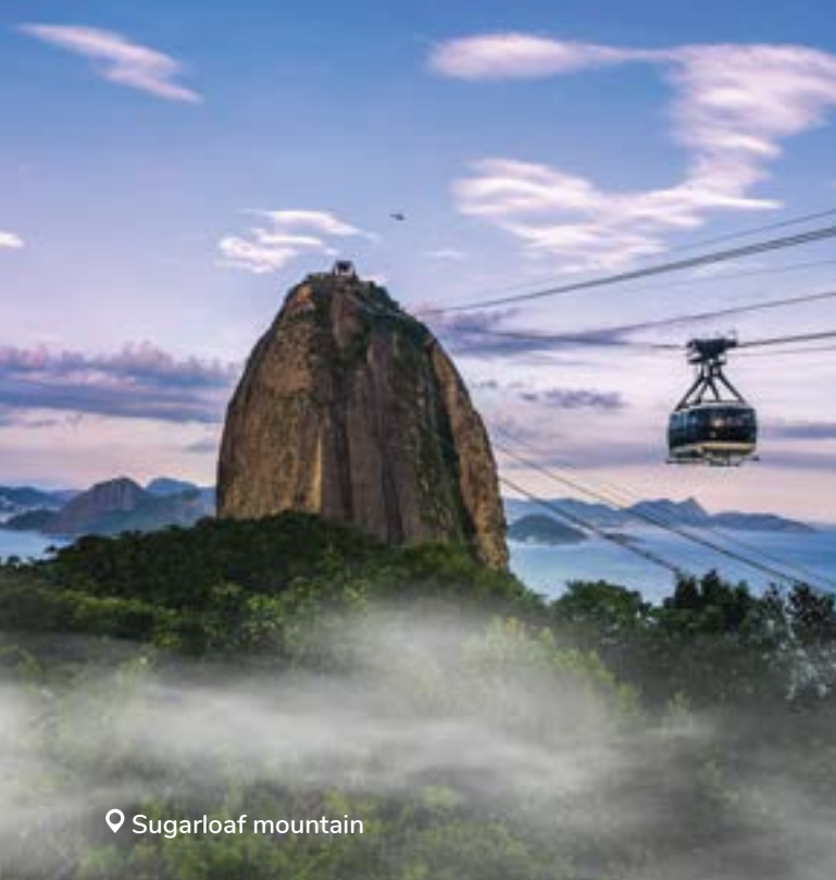
📍 Sugarloaf mountain