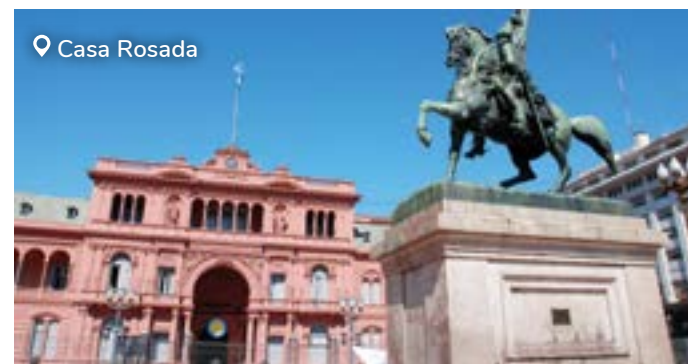
📍 Casa Rosada

In the afternoon you will be taken on a unique half day walking tour with your own local guide. You will start by exploring the streets of the upscale and exclusive neighbourhood of Recoleta through a local's eyes. Continue on through the beating heart of the city, Retiro, home to many significant government buildings filled with fascinating history of Buenos Aires. Chat with your guide over a local Patagonian ice cream or a coffee, before heading over to the bohemian barrio of San Telmo to explore the local markets, tasting local specialties. You will also visit an old Conventillo and the quaint Plaza Dorrego.