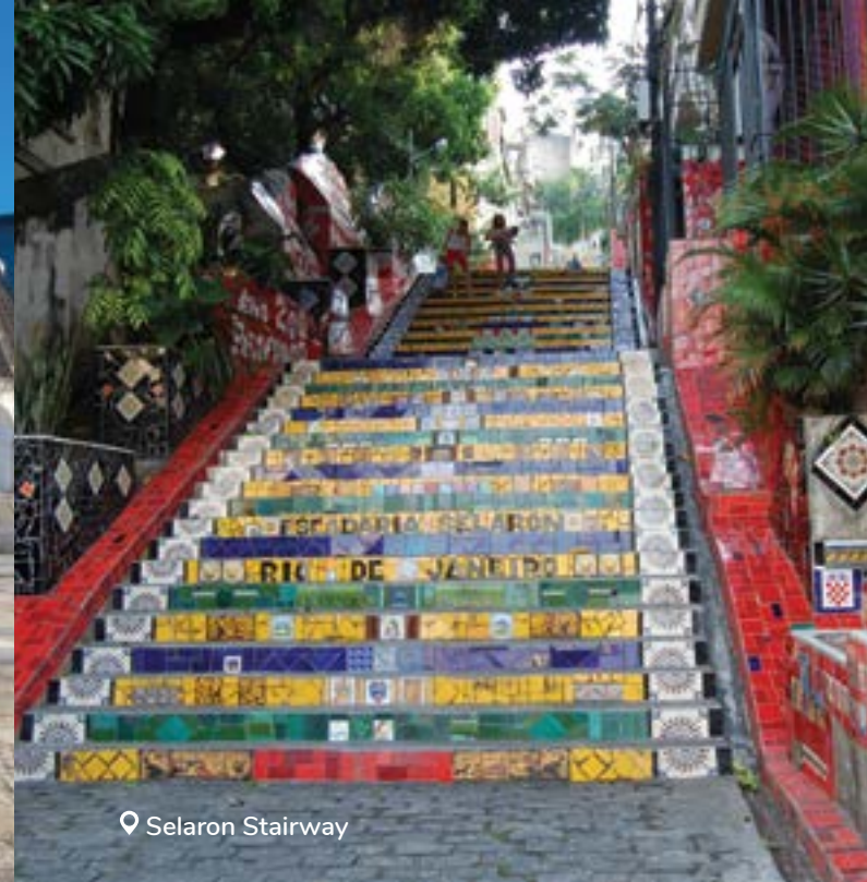
📍 Selaron Stairway