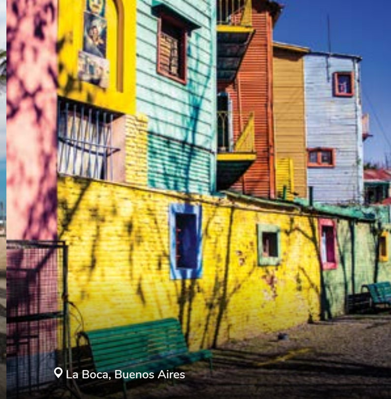
📍 La Boca, Buenos Aires