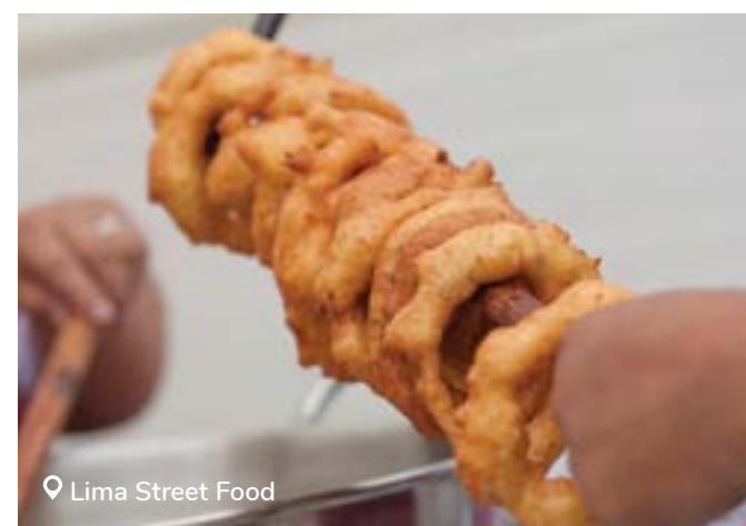
📍 Lima Street Food

Fly to Cusco, where you will descend into the Sacred Valley. The Sacred Valley of the Incas is a region in Peru's Andean highlands which, along with the nearby town of Cusco and the ancient city of Machu Picchu, formed the heart of the Inca Empire. The Sacred Valley's elevation is 2,800 meters above sea level, so it's recommended to take it easy for the afternoon as your body acclimatises to the altitude. (B)