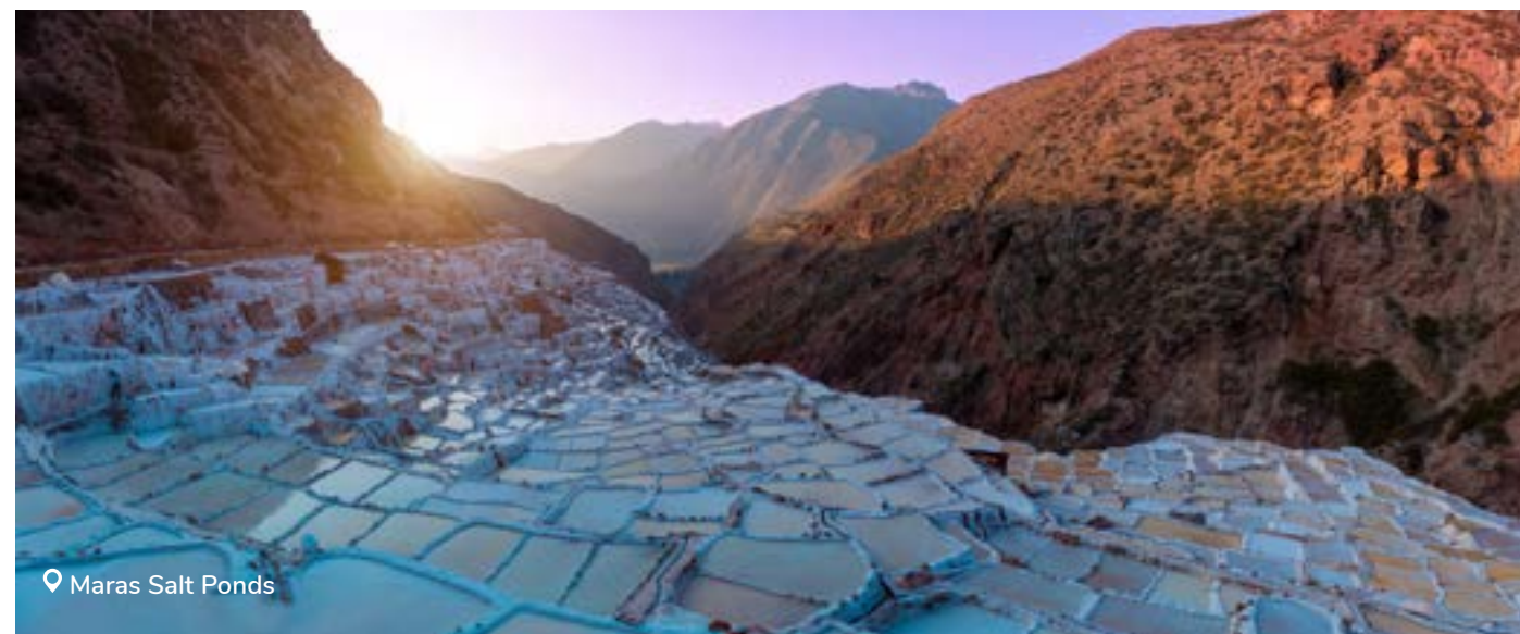
📍 Maras Salt Ponds