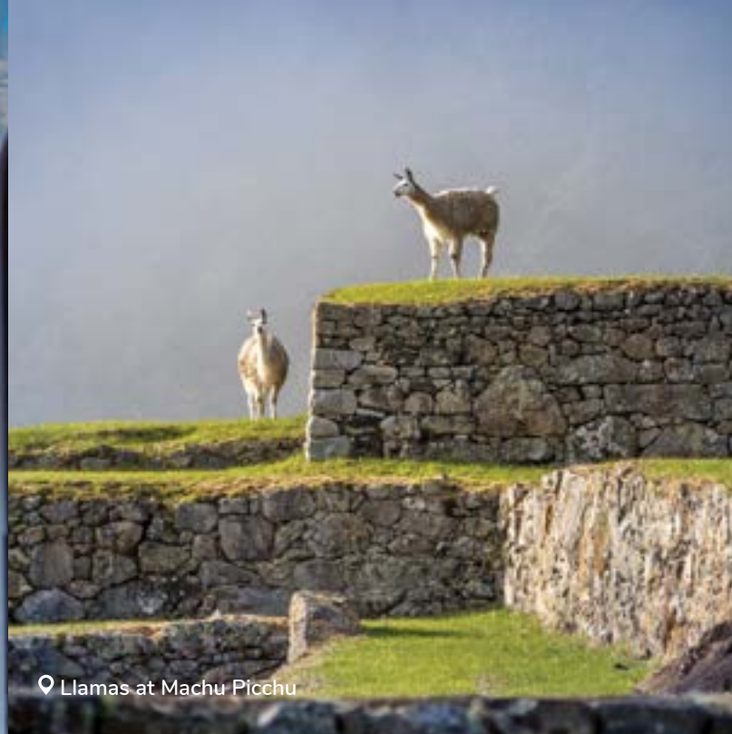
📍 Llamas at Machu Picchu