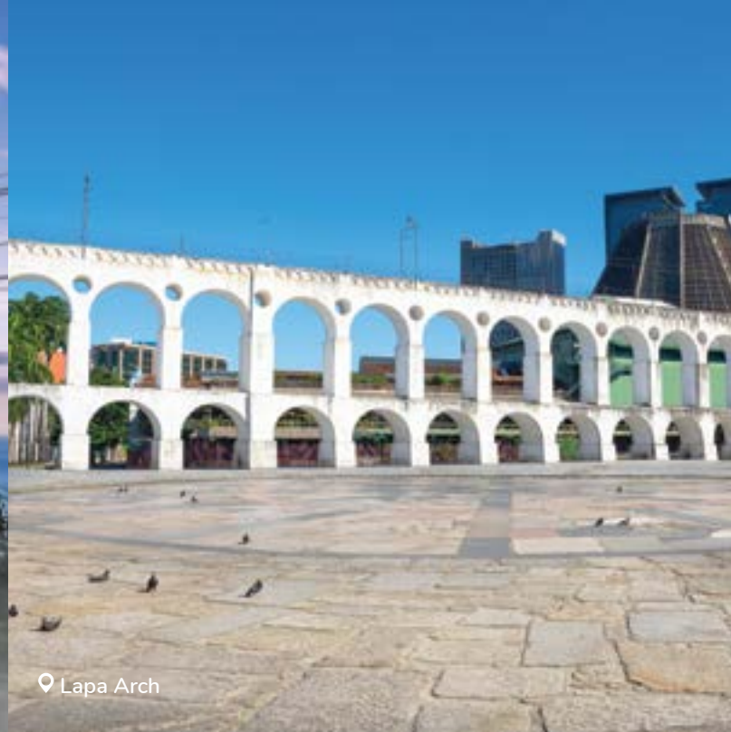
📍 Lapa Arch