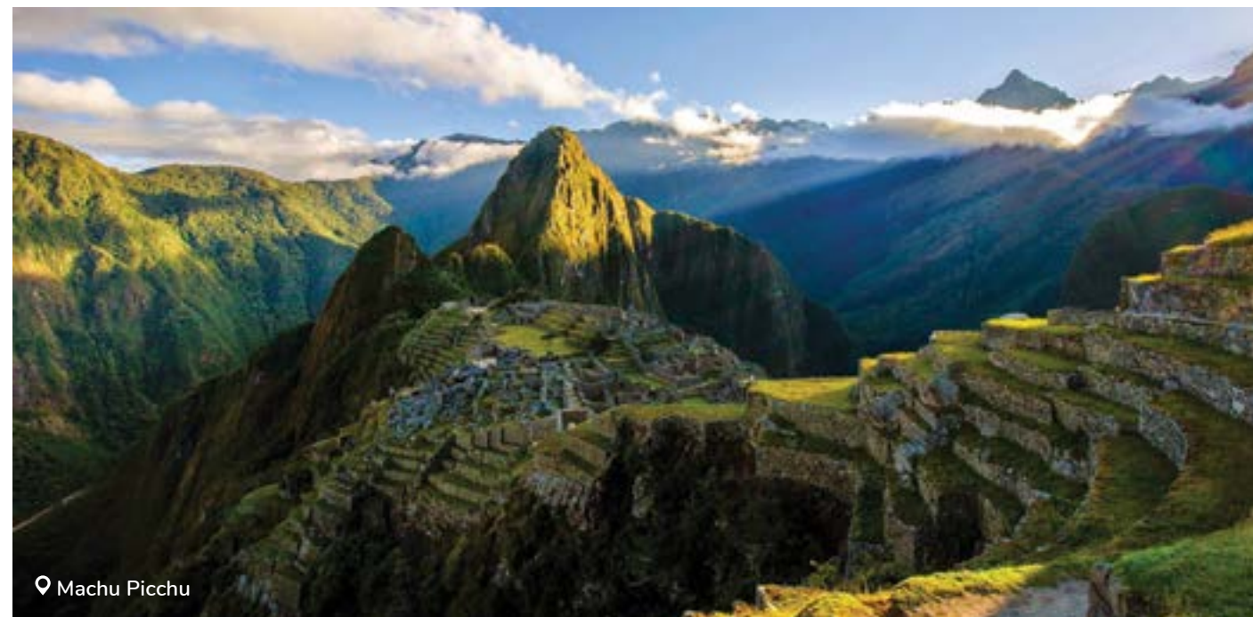
📍 Machu Picchu