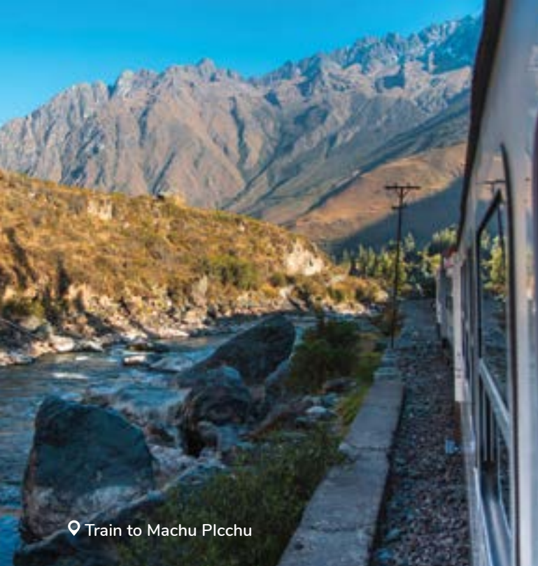
📍 Train to Machu Picchu